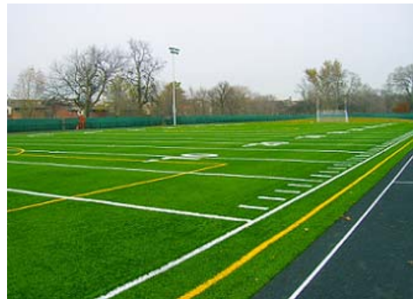
Typical New Turf field