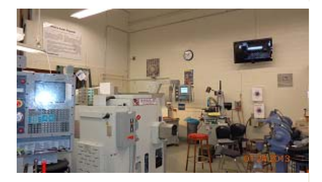
Typical Manufacturing Lab