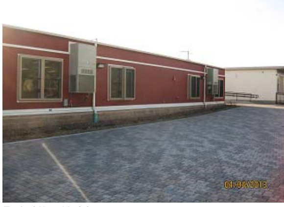
Typical New Modular