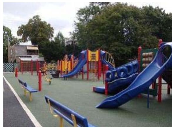
Typical New Playground