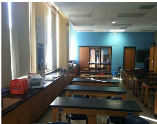
Upgrade science lab.