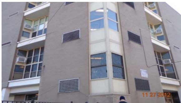
Replace window A/C units.