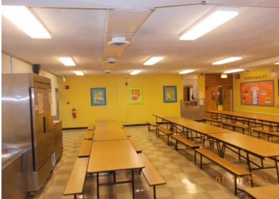
Add serving line to lunchroom.