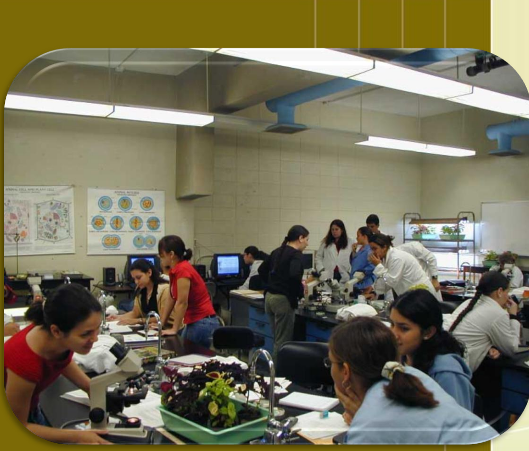
University of Puerto Rico - Biology lab

Designed for a variety of learning: small group, individual, large group, hands-on, independent research